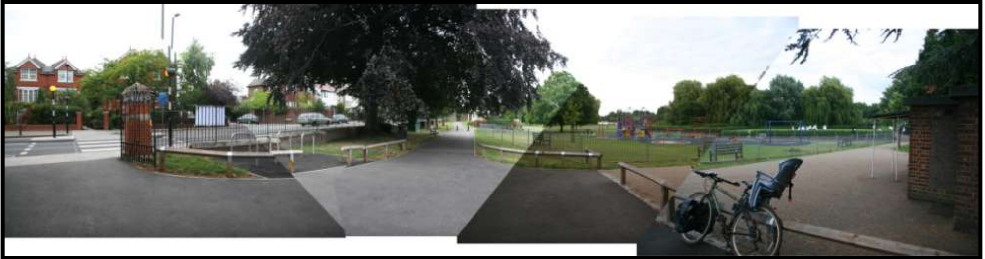
New entrance with bicycle parking and new zebra crossing leading into new playground with new paved area to café around playground area 9 July 2009