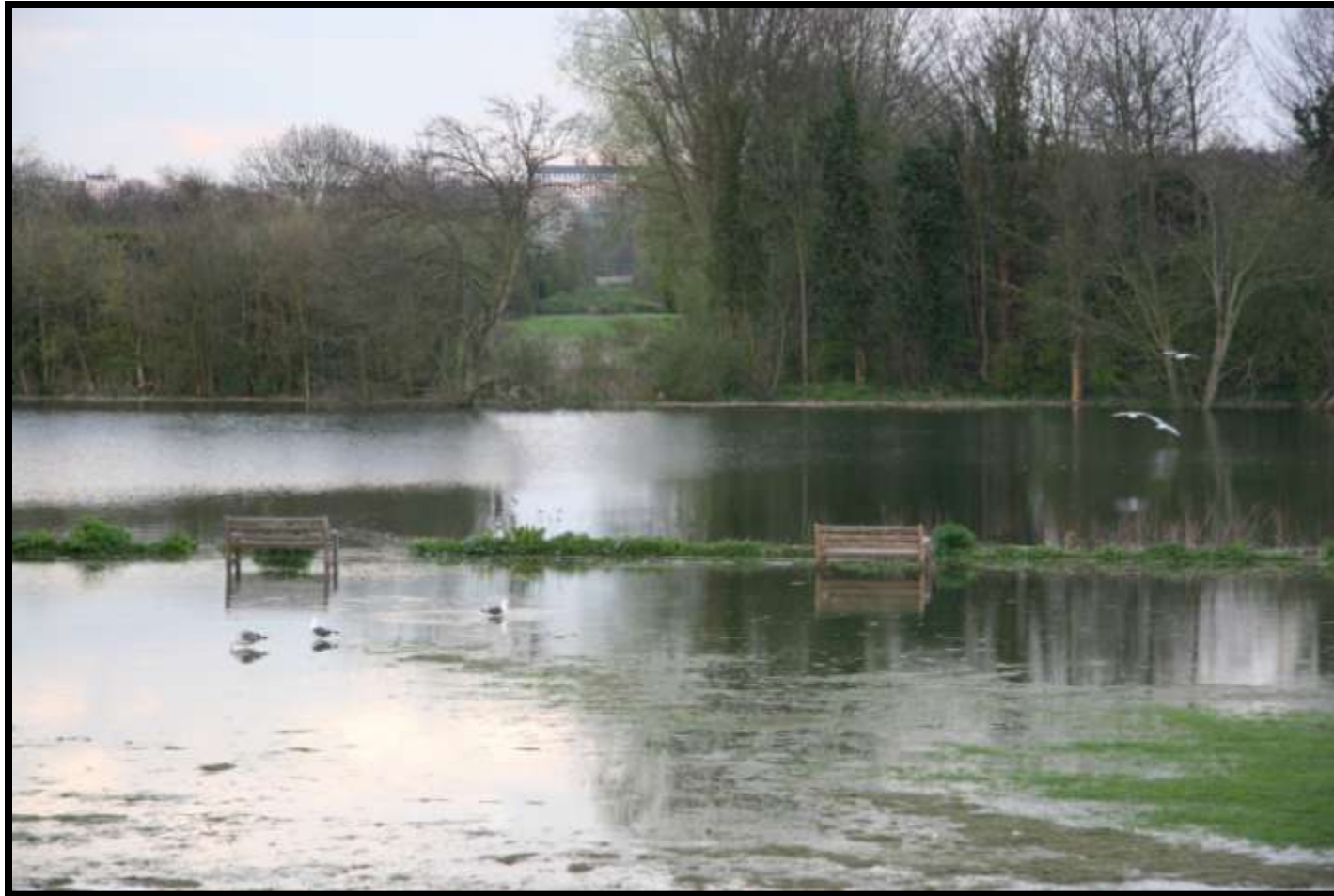
Historic views to Richmond Hill restored and new benches during flood tide