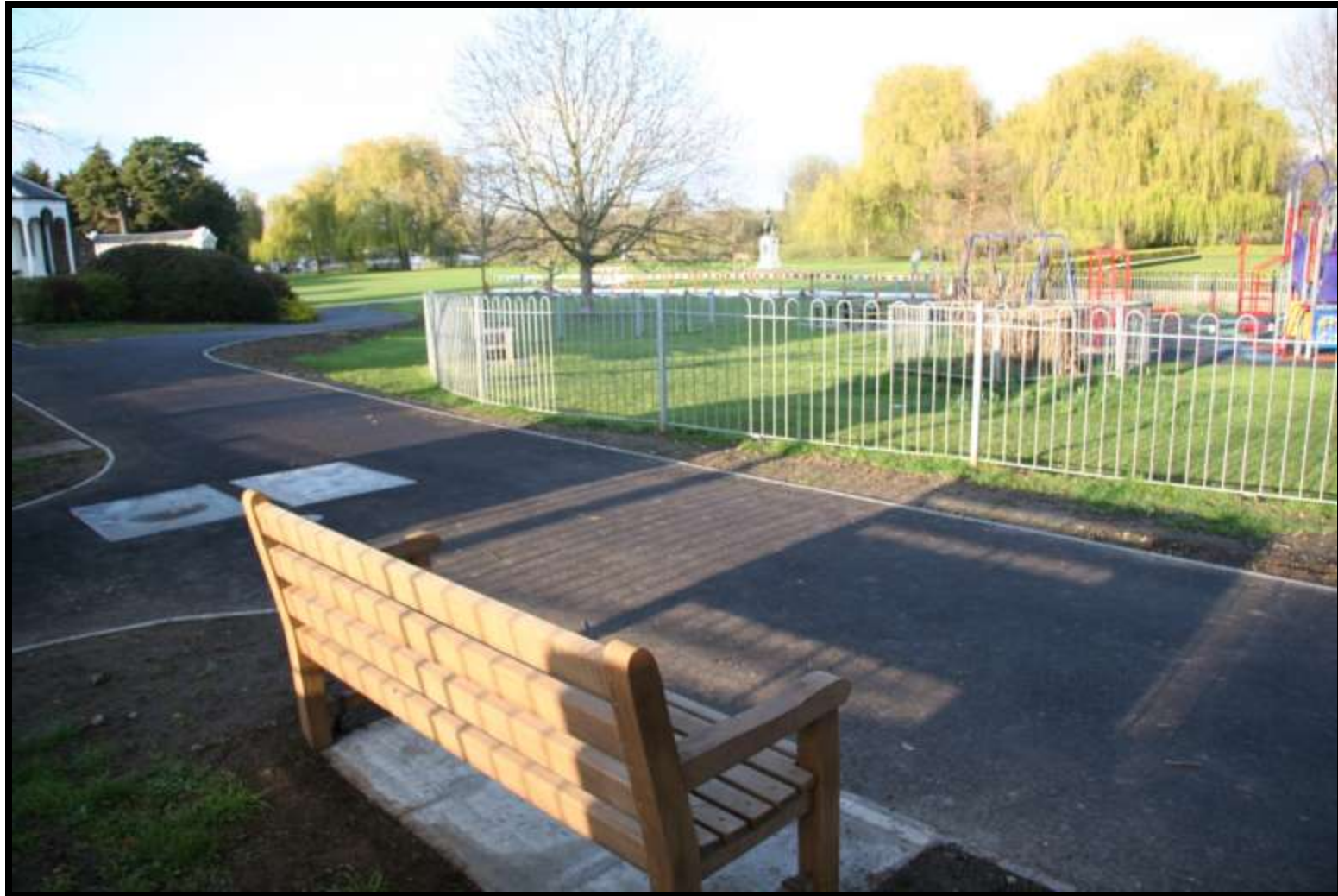
New benches and new paths and edging by new playground – some of the new trees are just visible in background 7April08