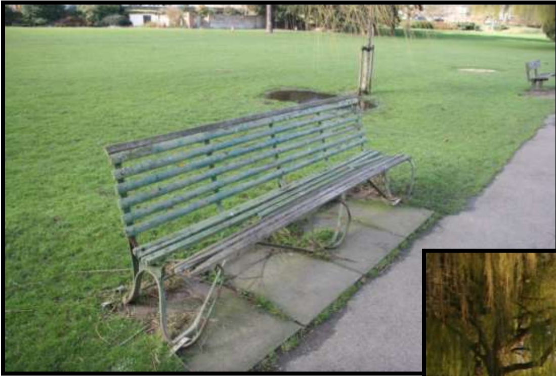
Above broken benches 26 Feb 2008 note new willows in background