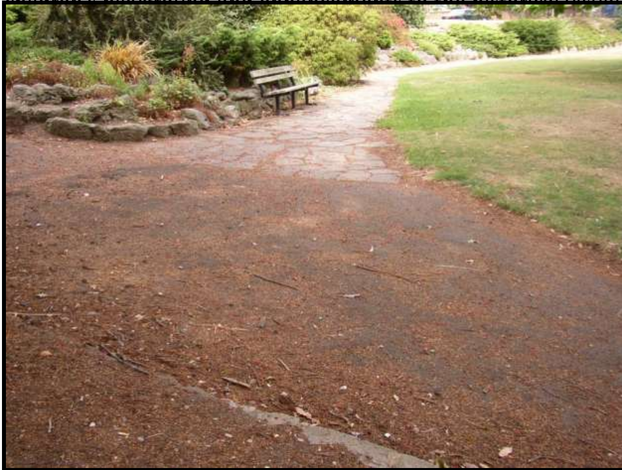
Crazy paving and mud and tarmac paths Sept 03

Approved Purposes Improvements to footpaths and planting to be complemented by improvements to children's playground and enhancements to the historical visual links.