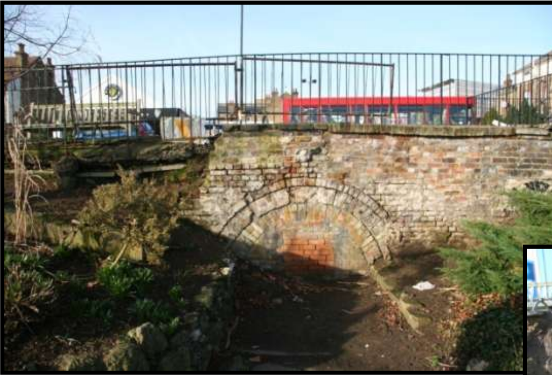
Above Radnor viewing platform collapsing wall and platform as viewed from the gardens before works 25 Jan 08