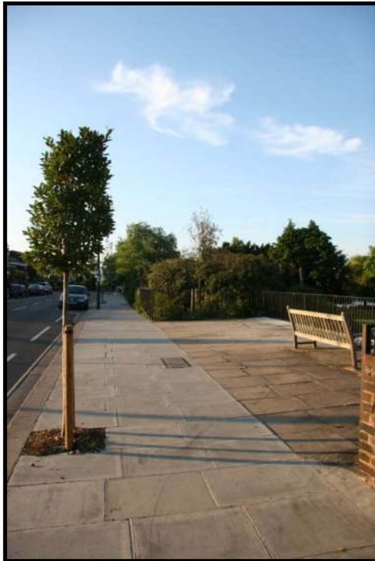
Above- Radnor viewing platform repaired Jun 09 with new street tree planting to screen the road from the gardens- there are 18 new trees planted to frame and screen key views