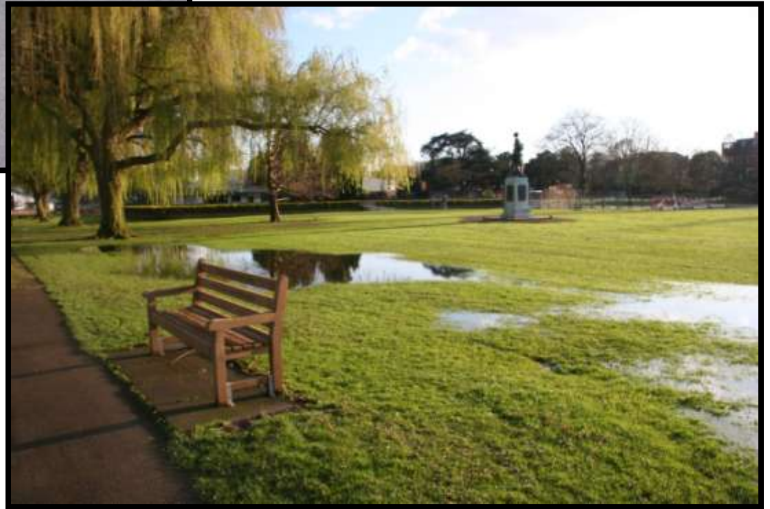
Below new benches 7 April 2008