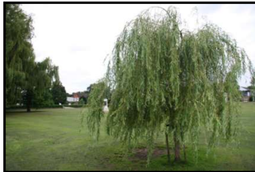
Some of the new 18 trees planted as part of the new landscape improvements to frame and screen views 9 Jul 2009