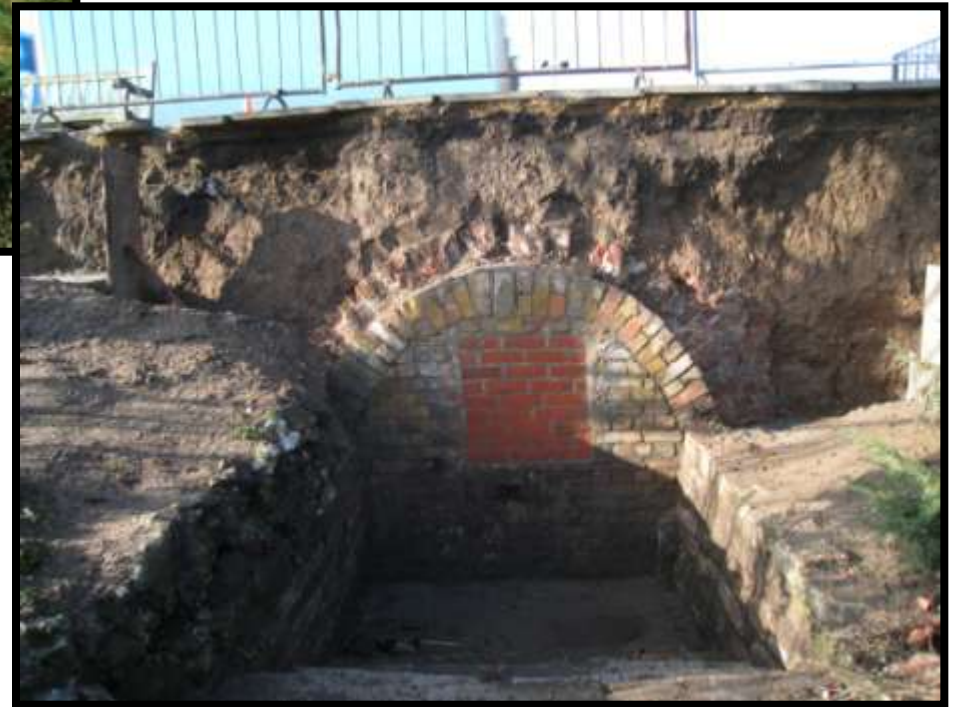
Below Radnor viewing platform collapsing wall and platform as viewed from the gardens works underway 29 Jan 09