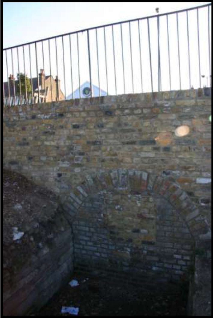
Repaired walls and viewing platform from Radnor Gardens Jun 09