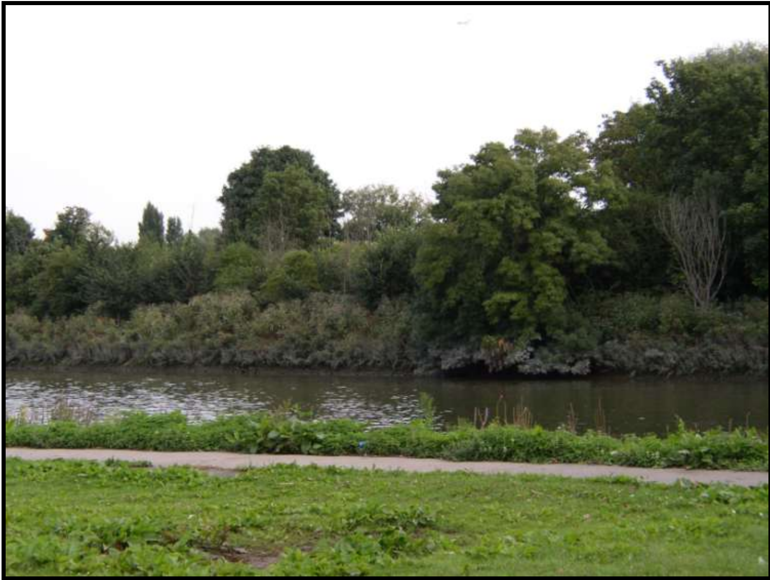
Historic views from Radnor Gardens to Richmond Hill blocked by scrub 6 Sept 2003