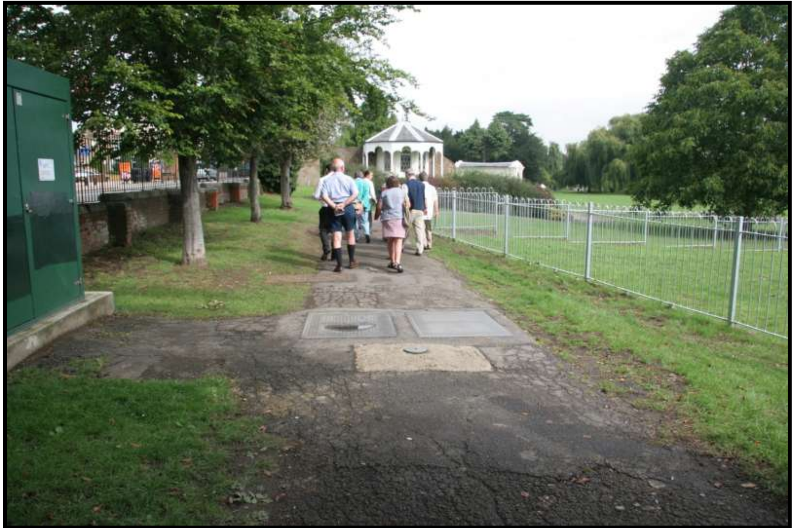
Old cracked paths and no benches around playground area 5 Sep 2005 before new improvements carried out