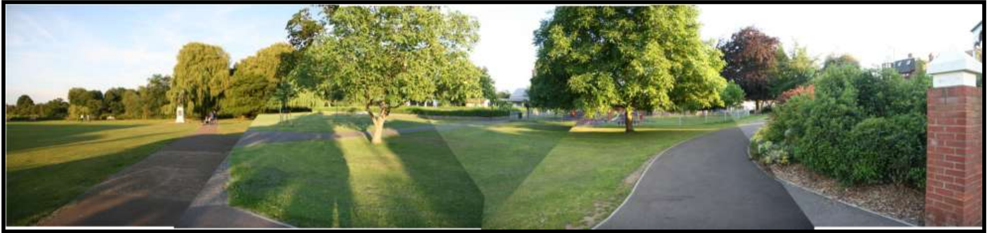
New paths and landscape with new planting beds 16 June 2009- note new playground in background