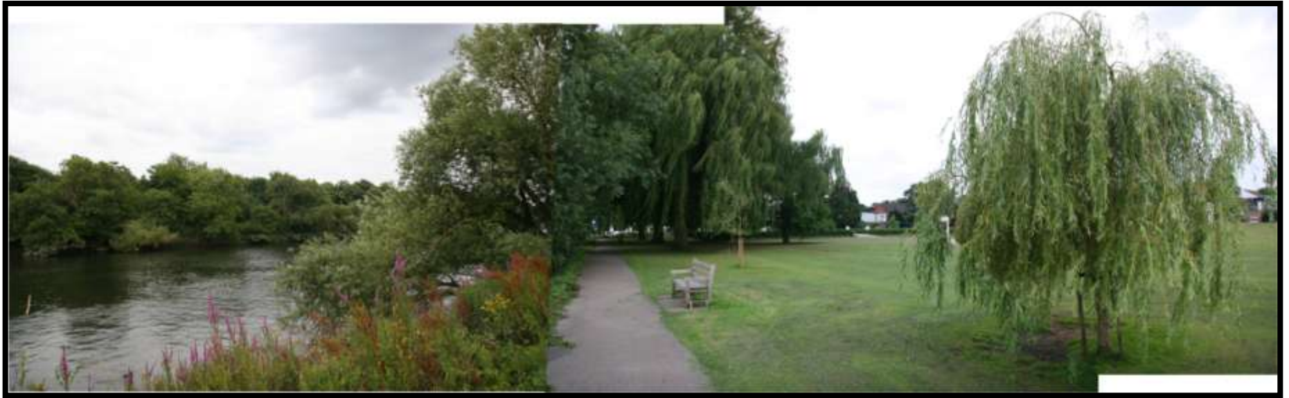
Landscape management improvements to revetment areas allowing greater diversity of native flora with purple loosestrife as a key indicator species in bloom whereas before area was dominated only by noxious Himalayan balsam – note new weeping willow tree planting along river as well 9 Jul 2009