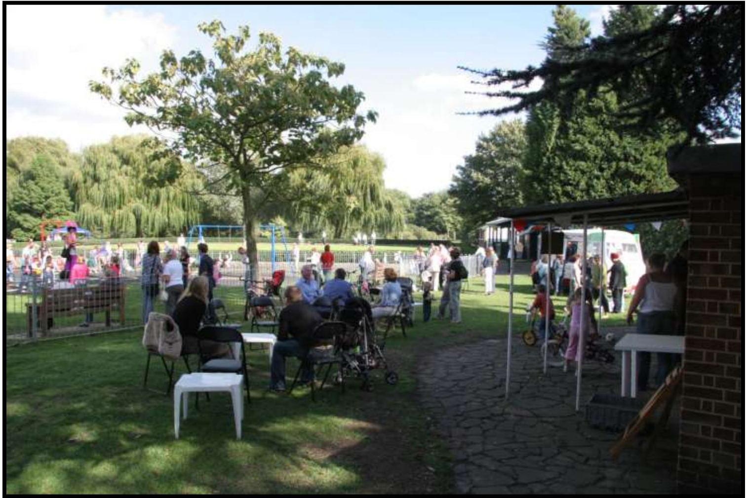
Picnic area and new paving by playground 25 Sept 09 before new improvements to café area