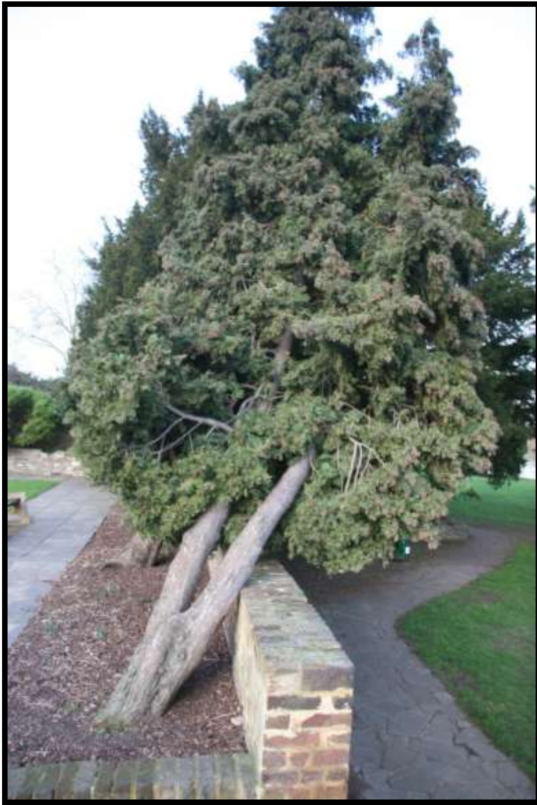
Collapsed Leylandii trees in Rose Garden with no roses Feb 04