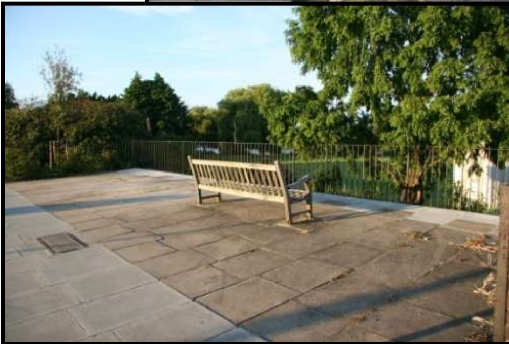
Above- Radnor viewing platform repaired Jun 09