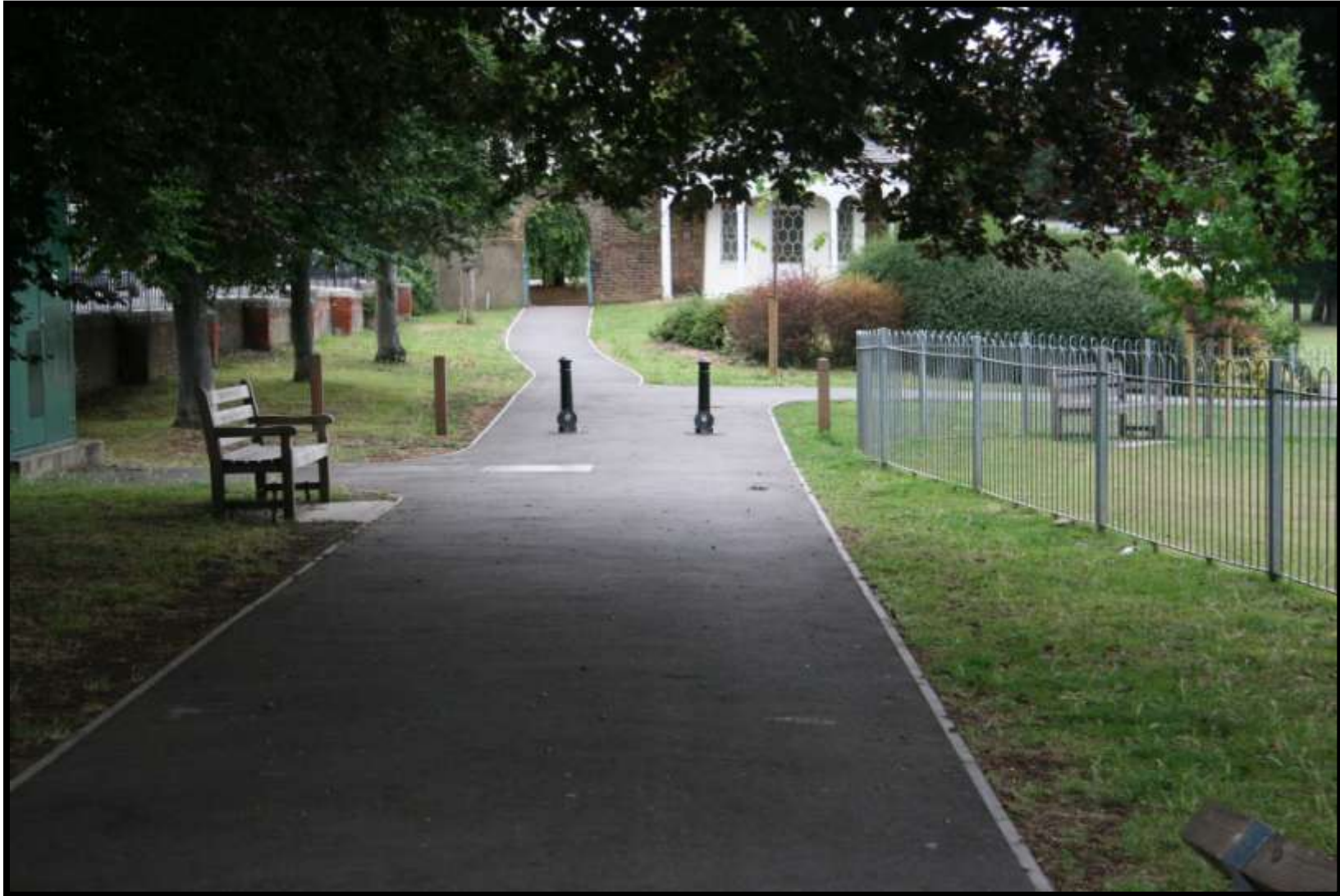
New paths, bollards, and benches around new playground area 9 July 2009