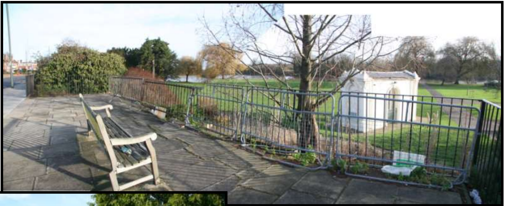
Above - Radnor viewing platform collapsing before works 25 Jan 08