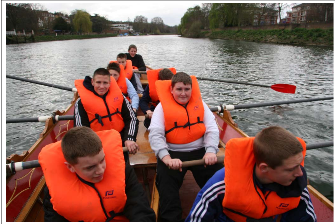
Youths from Ham Youth Club and Grey Court School out for their first trial rowing session on the HRH The Jubilant in the summer of 2007.