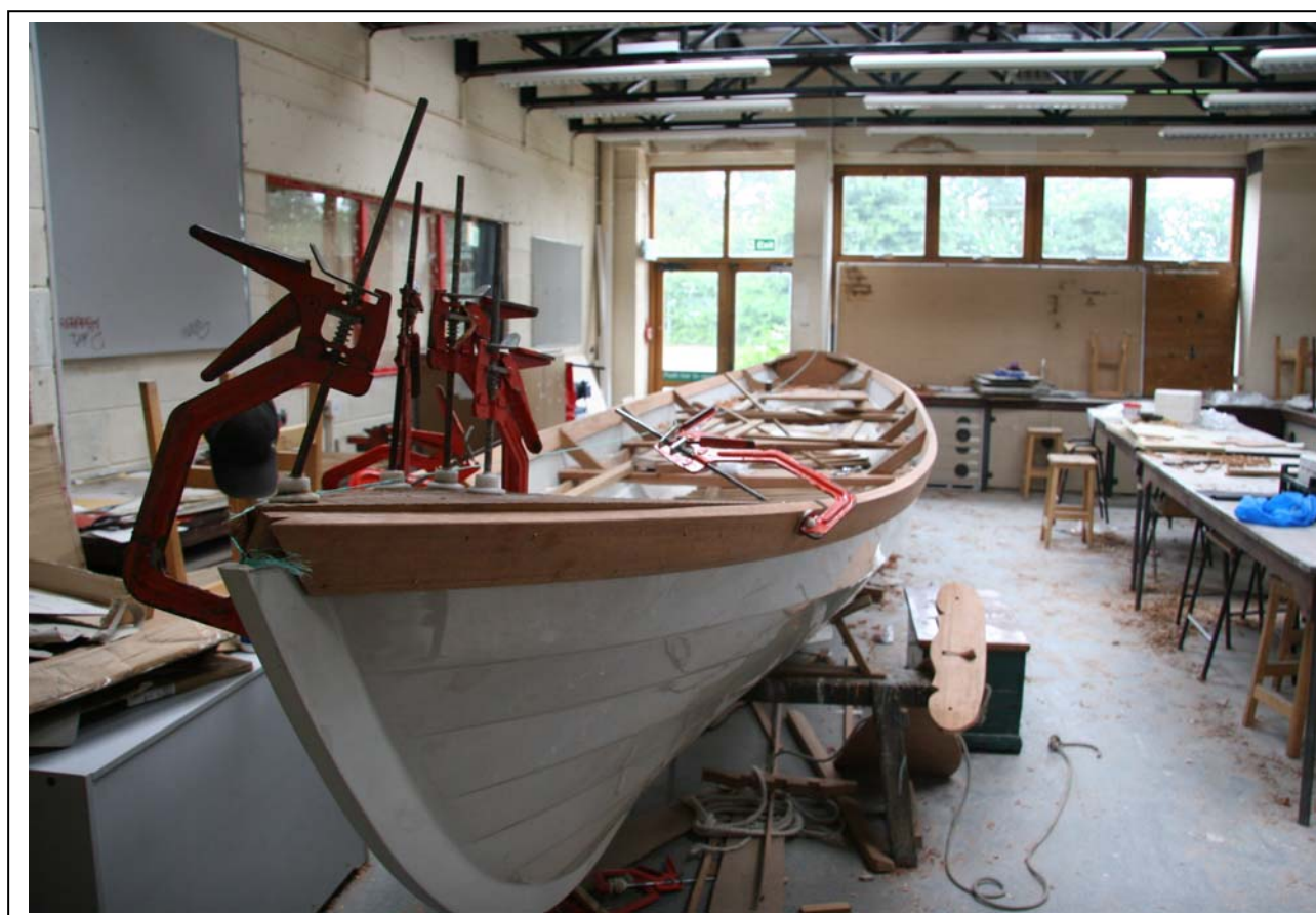
The wood work of the youths in progress in the work shop August 2008

For more information or if you would like to get involved or help with the Jolly Boat project please contact London's Arcadia on (44) 020 8891 7309 or by email to: arcadia@richmond.gov.uk