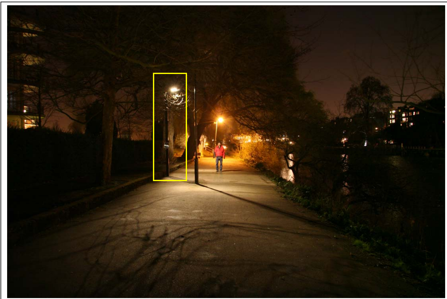
Photo showing the trial LED street light at night. The light emitted is a white light better for facial recognition than the current streets lights (visible in the background) which emit a yellow light. The LED light is fully directional; this can be seen in the reduction in light spill onto the river and into the atmosphere compared with that of the existing lights (visible in the background).

The public are invited to view the trial LED street light which is positioned between light columns 009 and 010 at the Richmond Bridge end of the Warren Footpath near Cambridge Gardens.